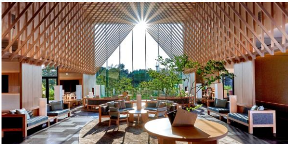
Lobby with full of natural daylight

On SORANO Premium Day – our guest appreciation day held once a month – drawings are held offering chances for guests staying on the day to win a hotel stay and for our restaurant dinner guests to win a meal. Please take advantage of this special event See here for details .