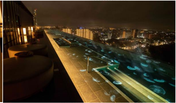
Jellyfish motifs of the Infinity Pool