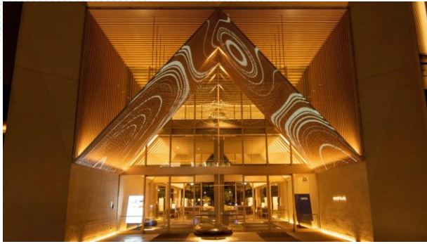
Motifs with dynamic movements of the tent-shaped canopy