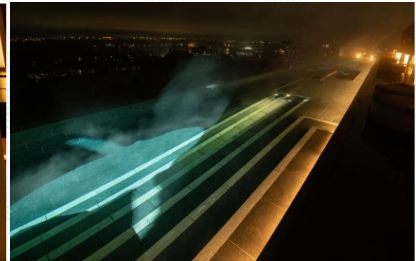
Huge Whale swimming leisurely

Please direct inquiries about this press release to: