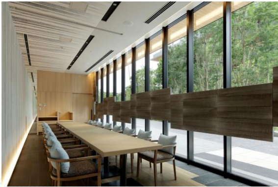
Private meeting room with natural lighting