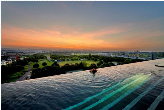
Stunning sunset viewed from our Infinity Pool