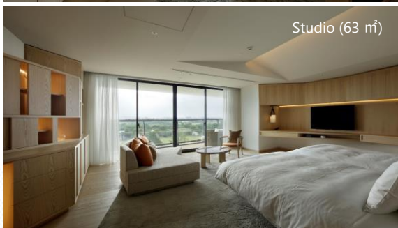
Studio (63 m 2 )