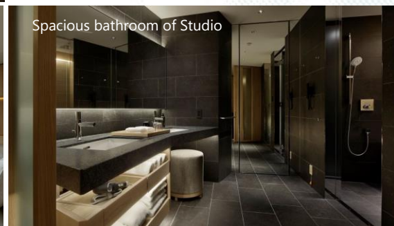
Spacious bathroom of Studio