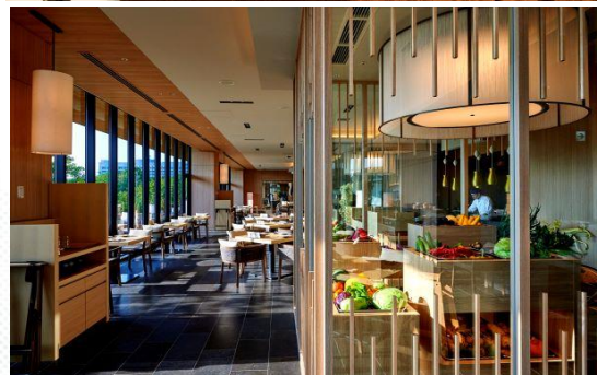
DAICHINO RESTAURANT welcoming visitors using our Spa Treatment & Lunch package