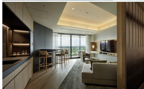
Our Spa Suite available for visitors using our spa treatment