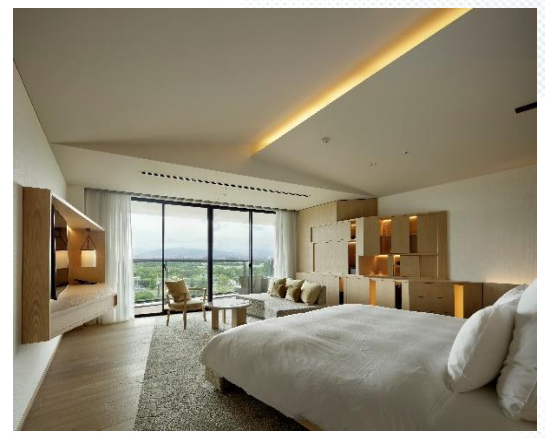
Guest Room (Sky King Park View)

*NATRUE Certification: Over 95% of the natural ingredients used are from organic certified producers. We use products of the highest rank in the three-level certification.