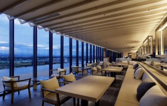
SORANO ROOFTOP BAR