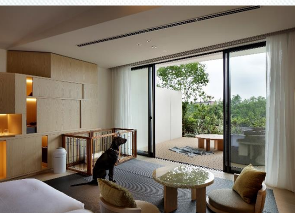
Guest Room (Dog-friendly Wa Modern)