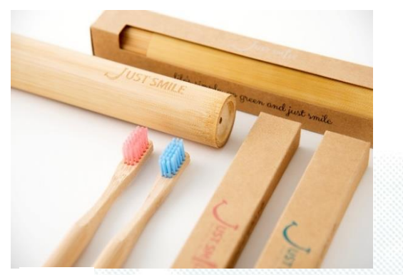
Just Smile toothbrushes