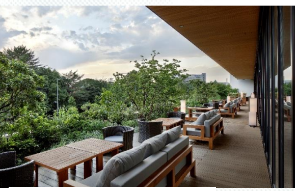
DAICHINO RESTAURANT Terrace Seats