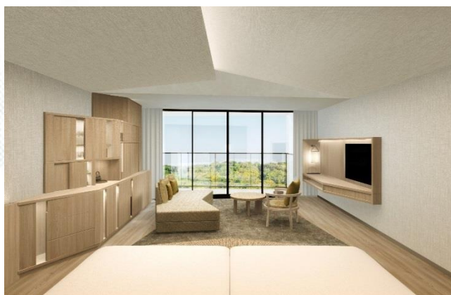
Guest Room (Premier Park View)

Tachikawa, where SORANO HOTEL is located, is 30 minutes from central Tokyo (using the JR Chuo Line). Tachikawa is currently gaining attention as a city where urban functions are pleasantly integrated with the natural environment. Conveniently located 500 meters from Tachikawa Station, the hotel has spacious rooms at least 52 square meters in size and is fully equipped with an infinity pool, hot bathing facility, and indoor spa using privately drilled hot spring water. The lush greenery of Showa Kinen Park also spreads in front of the hotel. This newly opening hotel blessed with a superb environment is perfect even for long stays.