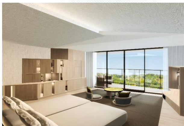
Guest Room (WA MODERN Park View)